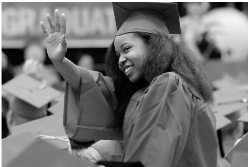
Saddleback College Commencement 2013

To view the most current list of Saddleback College Associate Degrees for Transfer and to find out which CSU campuses accept each degree, please go to http://californiacommunitycolleges.cccco.edu/Students/AssociateDegreeforTransfer.aspx . Current and prospective community college students are encouraged to meet with a counselor to review their options for transfer and to develop an educational plan that best meets their goals and needs.