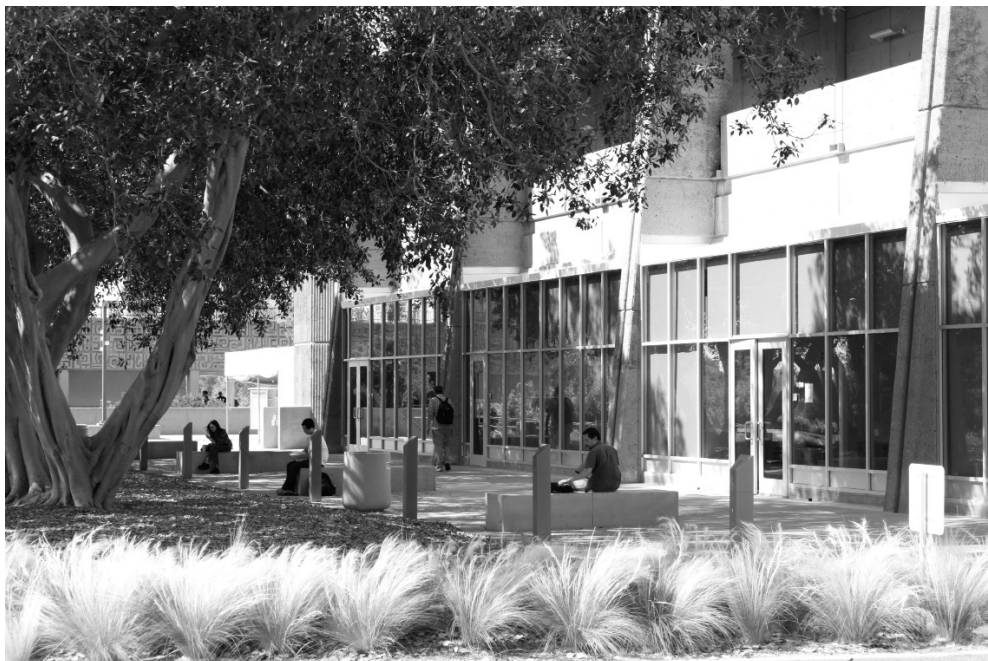
Saddleback College Library / Learning Resource Center

The VETS Center is located in the Student Services Center, Room 207. For more information, phone 949-582-4252, visit our website at www.saddleback.edu/vets , or email us at vetsoutreach@saddleback.edu .