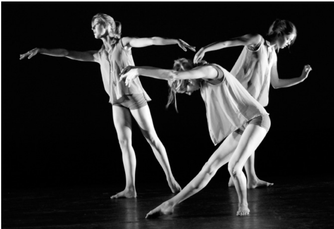
Saddleback College Dance Collective 2013

Final examinations are held in all subjects according to the schedule that is published by the Office of the Vice President for Instruction each semester. No student will be excused from any final examination without approval from the Office of the Vice President for Instruction.