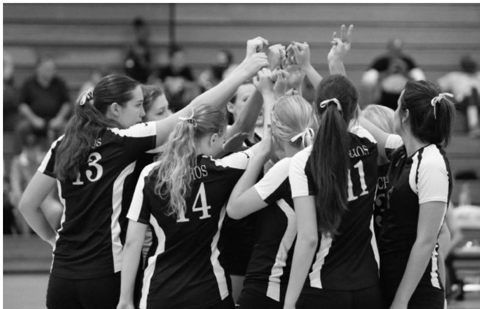
Women's Basketball 2013

Refer to the Graduation Requirements or to the CSU-GE and IGETC patterns in this catalog for specific courses which meet general education requirements. Refer to ASSIST.org and to the transfer institution's catalog for transfer requirements.