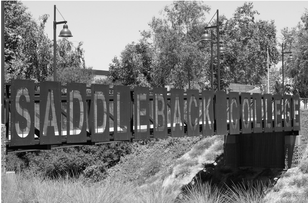
Saddleback College campus bridge

28000 Marguerite Parkway Mission Viejo, California 92692 949-582-4500