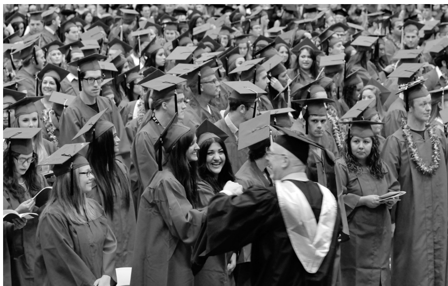
Saddleback College Commencement 2013