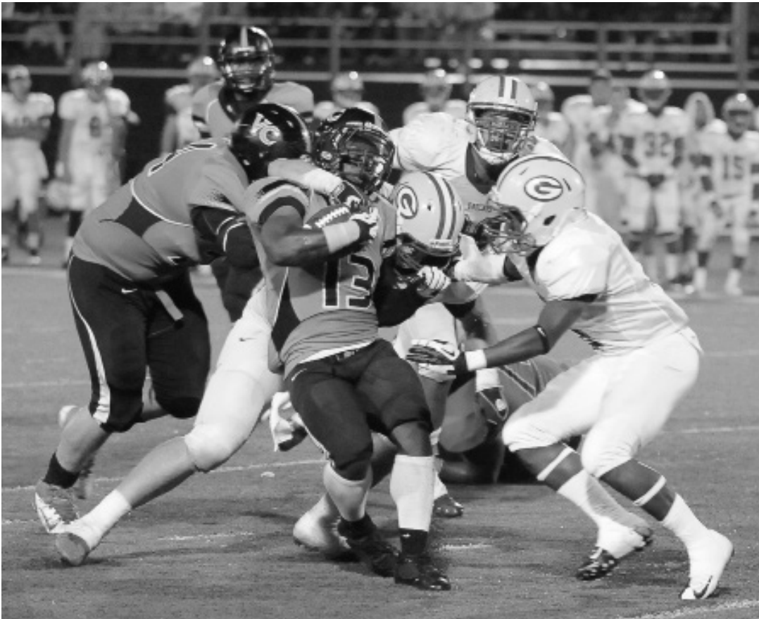
Saddleback College Football 2013

Developed in collaboration with the California State University (CSU) and University of California (UC) to allow students to obtain information about higher education opportunities in California.