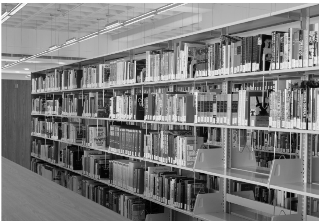
Saddleback College Library

The Special Topics course is a grouping of short seminars designed to provide students with the latest ideas in a field of study. The course content is thematic in nature and each seminar within the course differs from other offerings in the same course. NR Please include Mathematics Course Sequence Diagram from p. 200 in the 2012-2013 Catalog [MATH 251A & 251B need to be removed from the diagram as these courses came through for deletion]